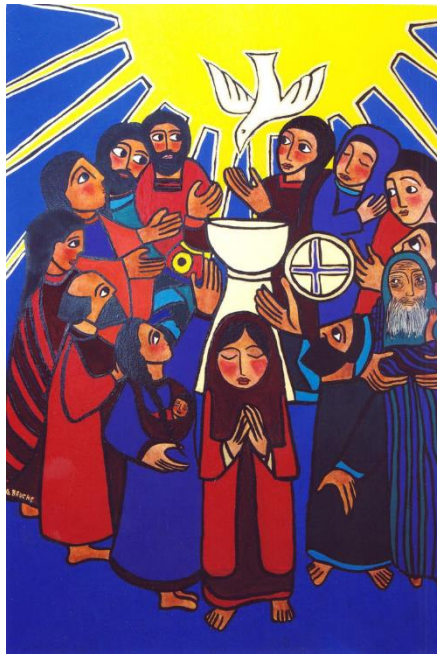
The Coming of the Holy Spirit – Gisele Bauche acrylic, contemporary