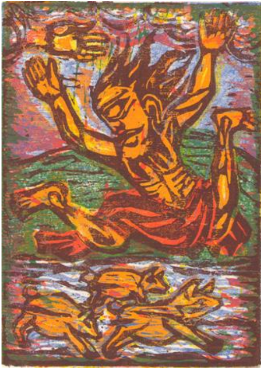
The Demons Cast Out, Solomon Raj, India