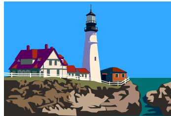
Always on the look out for the NBT.

Second, we will be replacing the carpet around the altar. We had hoped to do something a little more exciting, but the temperature swings and the two different kinds of surfaces